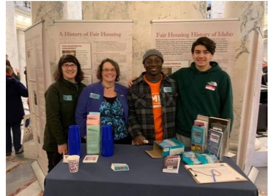
Intermountain Fair Housing Council IFHC's Fair Housing Exhibit

In 2019, despite the six-month delay in federal funding, community need for IFHC's services doubled. We received twice the number of housing discrimination calls in the first three months. We negotiated or mediated most allegations of discrimination and filed 10 fair housing complaints involving disability, race, national origin, and familial status discrimination with HUD.